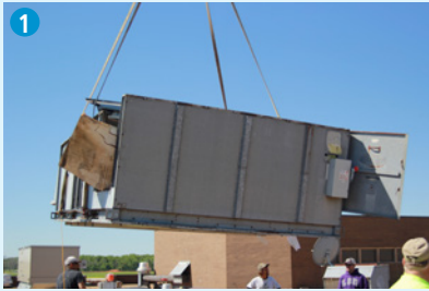
1 Removal of existing unit