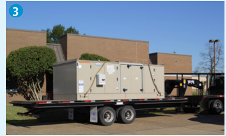
3 Single-piece unitized base rigging