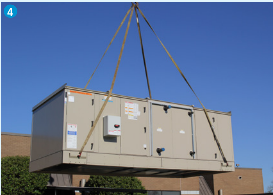
4 Rigged and lifted