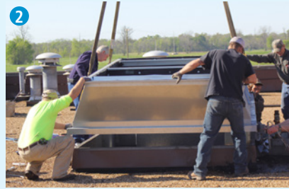
2 Lift and set of new retrofit curb