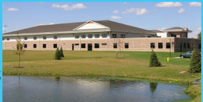
Finished site with pond

The geoexchange system at Jorgensen YMCA uses a series of bundled polyethylene tubes that are submersed in a pond adjacent to the building. The tubes circulate fluid, which dissipates heat to the pond when cooling is required, and absorbs heat from the pond when heating is required. The 47 Daikin Enfinity water source heat pumps located in the building use this heat exchange to distribute cool (or warm) air to individual areas