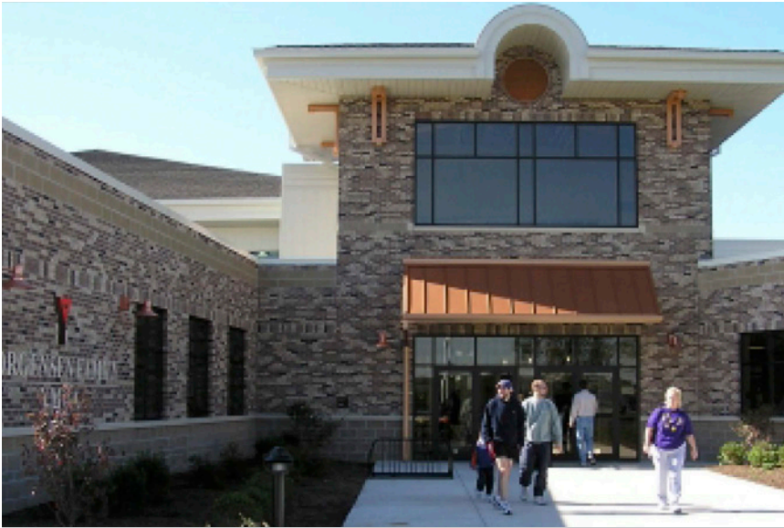
The Jorgensen YMCA in Fort Wayne, Indiana, boasts some high impact-and highly desired-sports and community amenities.