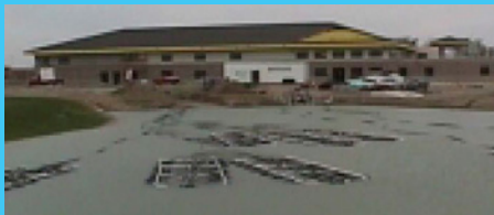
Site in progress