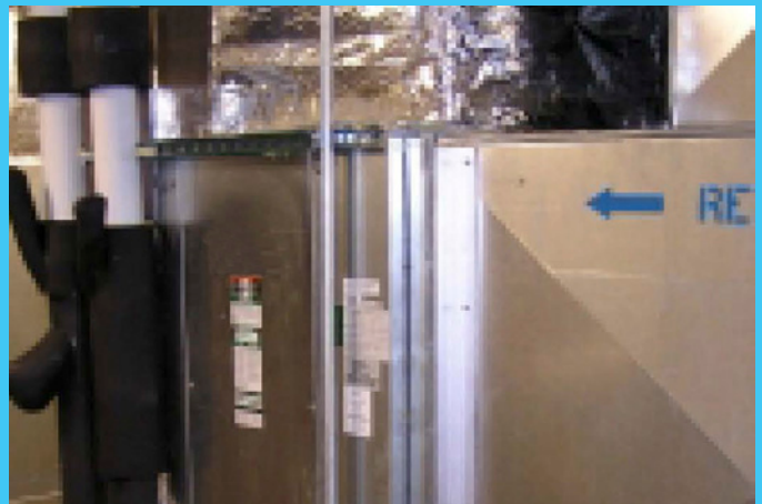
One of the Daikin Enfinity™ water source heat pump