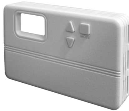
Figure 4. Thermostat cover without 3-speed switch opening