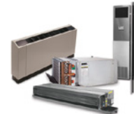
Fan Coils 200 to 3,000 cfm