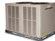
Single Circuit Condensing Units 6 to 20 tons