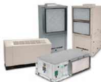
Water Source Heat Pumps ½ to 25 tons