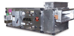
Destiny® Indoor Air Handlers 600 to 15,000 cfm